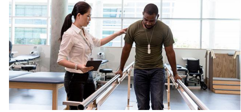
Durable Medical Rehab and Equipment