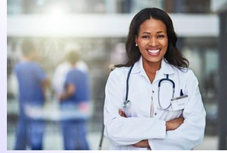
All Doctors Services